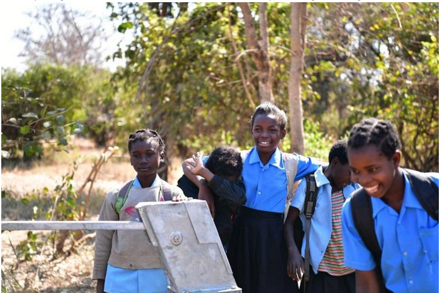
At last the pump is in.