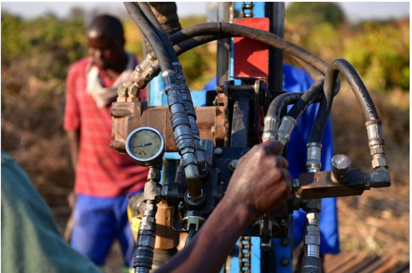
Drilling at Mfuwe Primary School