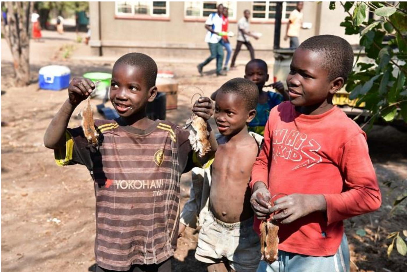
Some passing mouse collectors (roasted mice are a local delicacy) watching the drilling