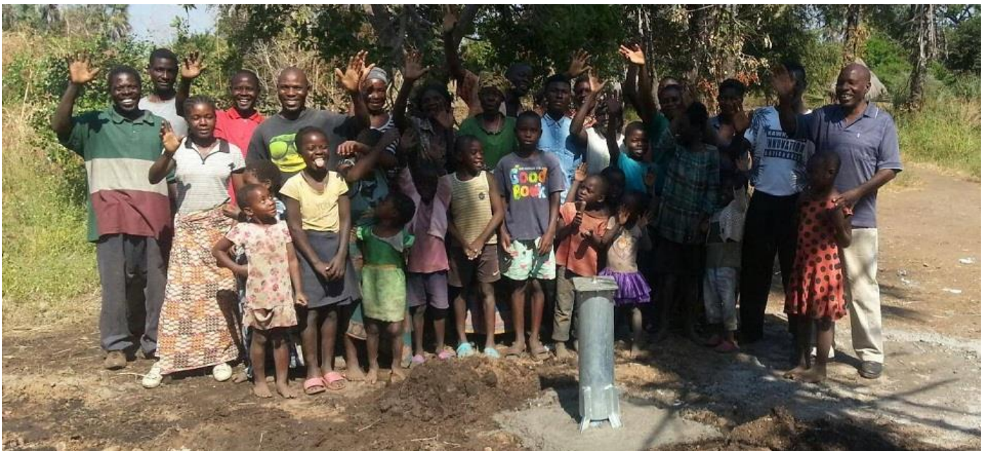
Thank you from Zandonda, Mwebwa and Chiumbu Residents.

Not only will the dangers of water borne diseases now things of the past, but now the women and children have more time for education, sports, farming and other pastimes. The communities in which we install our boreholes create productive vegetable gardens which produce more than enough for their own needs and dramatically improve nutrition. The excess is sold locally providing a useful cash income and adding to food security. Each borehole means that a community of at least 200 men, women and children, instead of travelling miles to dangerous rivers or scooping dirty water from shallow wells, can access to clean, safe water - for life.