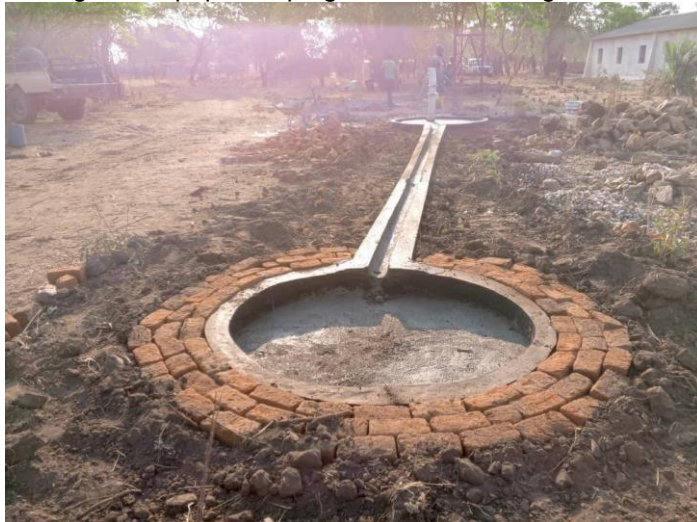
The beautiful new borehole!