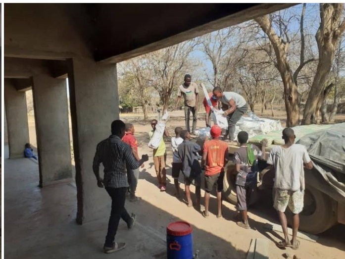
Willing Msoro pupils helping with the offloading