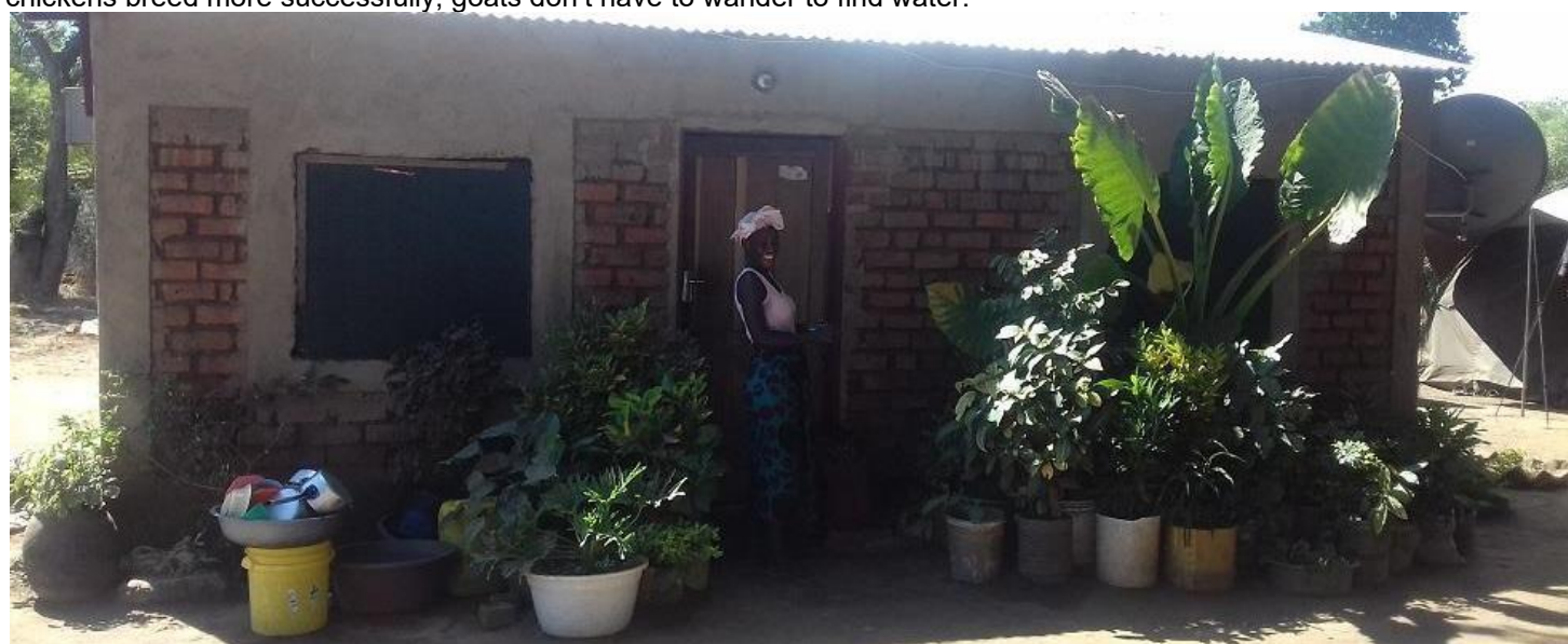
Beautiful front garden made possible with plentiful water nearby for easy and non-wasteful watering.