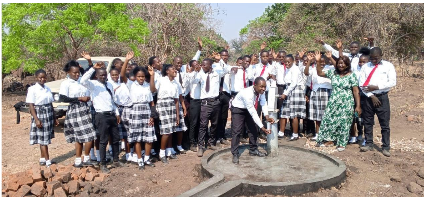
Happy Msoro Headmistress and thrilled pupils trying the hand pump for the first time!