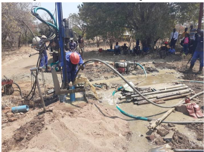
Drilling is underway at Msoro School/Gilimon Village