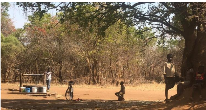
Msoro Villages – shallow, unhygienic well.

Around 40,000 people live in the villages of Msoro Chiefdom and the population is rapidly growing. It has doubled in the last 20 years and continues to grow yearly. The communities are mixed; most of them farm close to subsistence level depending on growing their food, mainly maize and sorghum. It's a very large and quite diverse Chiefdom; parts of it are very hard to reach, impossible in the rains, and it's one of the areas of the Luangwa Valley that is least served by conservation and charitable organizations. This year, 2024, we received a file full of applications from Msoro so headed down to see how we could help. We found the situation very urgent with a serious lack of functional water points. Many communities are either using shallow hand-dug wells which dry up by October each year, walking long distances to already over-used boreholes or resorting to dry river bed wells which are shared with domestic and wild animals.