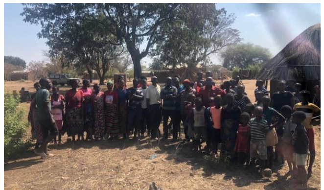
Community gathers to hear the good news that clean water is coming.