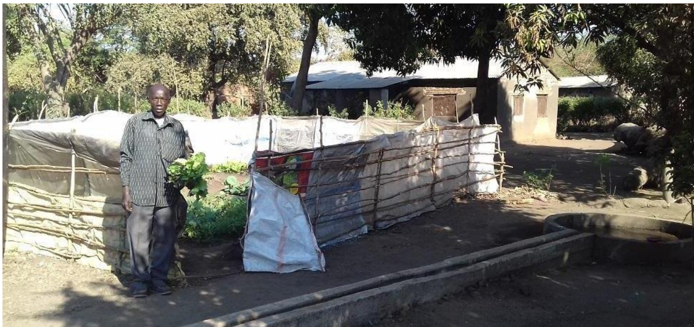
Village Headman with a productive vegetable garden. He has constructed the garden fence using empty sacks that would otherwise be thrown away. Until the Village received a borehole it was too difficult to get water for gardening.