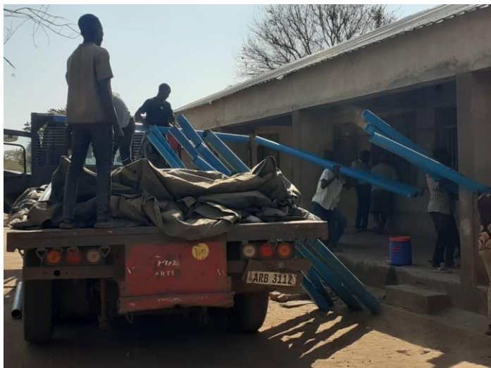
Offloading at Msoro School for the drilling

A borehole had been drilled by another organization but it failed, leaving the school and surrounding households without water. This has been particularly problematic for the secondary school girls who are boarding. No water for showering, cooking, or laundry..... Almost unimaginable.