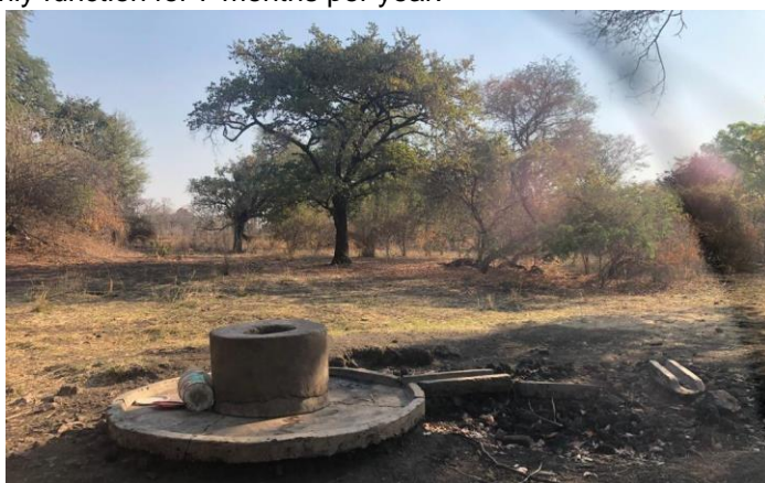
Completely unsuitable for human use, but sometimes there's no alternative when wells – like this one above, dry up.