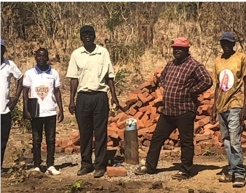
Previously drilled borehole done by 'cowboy' drillers– never worked.