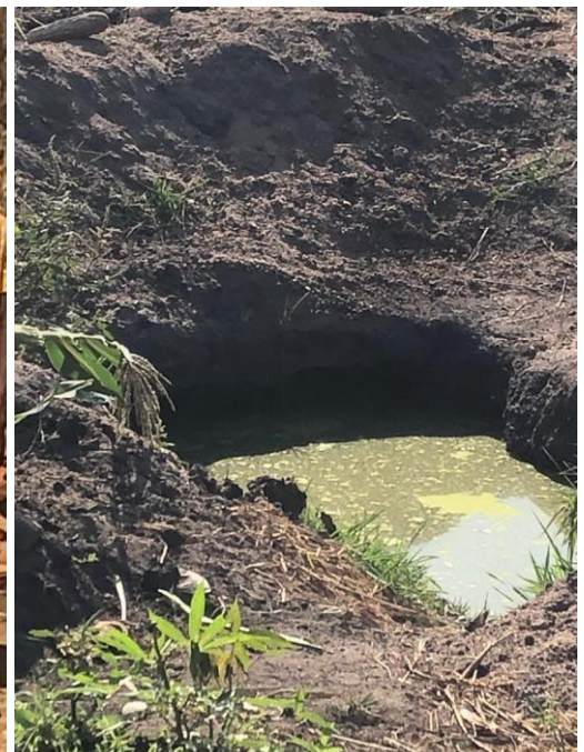
Water hole used by people and animals