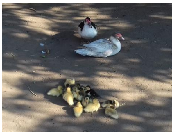
Food security and variety in the village have improved immensely with this simple innovation. There is no water waste and no muddy puddles for mosquitoes to breed - we are told that the incidence of malaria has reduced. Ducks and chickens breed more successfully, goats don't have to wander to find water.