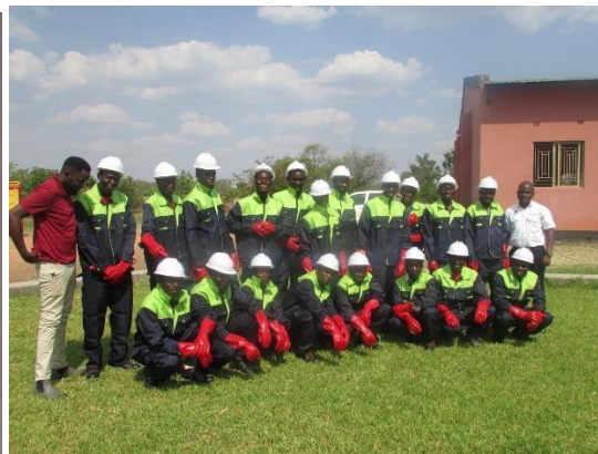
Area Pump Mender Training sponsored by Makolekole and facilitated by Mambwe Council Water Department.