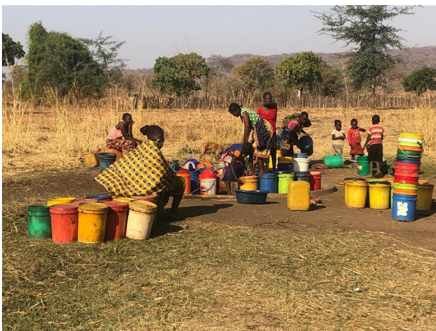
Well capped and small pump installed - not enough capacity meaning a very long wait from before light for women water collectors. Capped wells are unhygienic and most only function for 7 months per year.