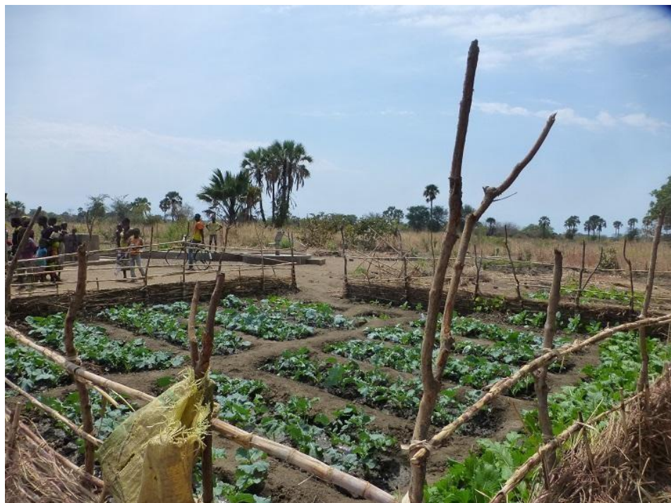
Proud gardener in the Village Community Garden which is irrigated with the overflow from the village borehole (in the background) growing green leafy vegetables like rape, spinach, and Chinese leaves.